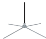
(X) Base Options